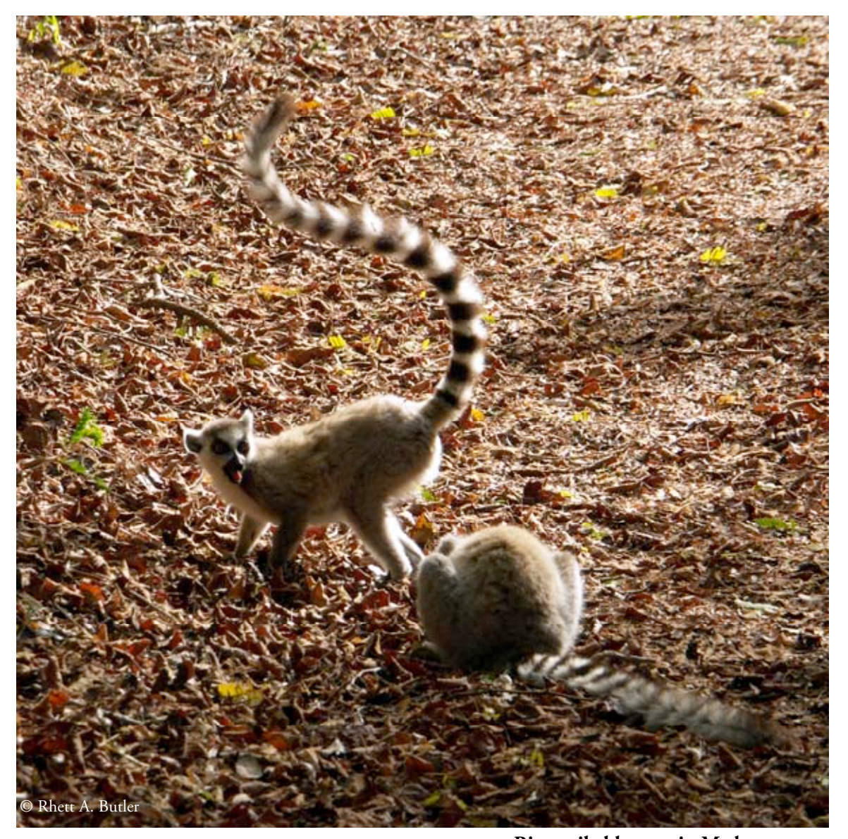
Ring-tailed lemurs in Madagascar