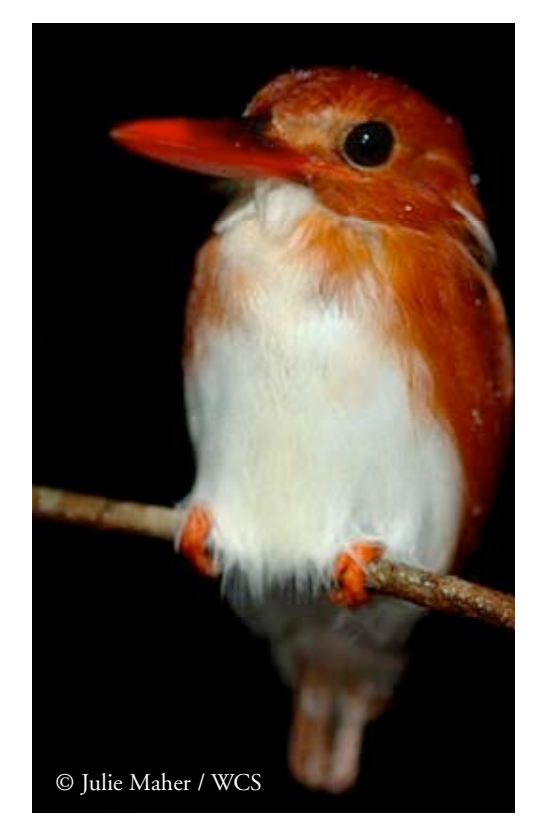
Madagascar Pygmy Kingfisher (left) This kingfisher is endemic to Madagascar.

Madagascar is home to 258 bird speices of which 115 are found nowhere else in the world. Madagascar once had giant land birds, the largest of which weighed over 1100 pounds (500 kg) and stood ten feet (3m) tall. Elephant birds (Aepyornis) were driven to extinction in recent history by human hunting, introduced species, and habitat loss.