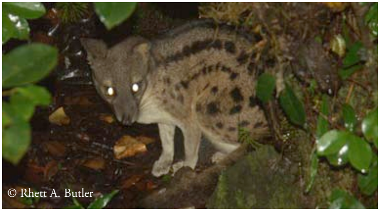
Narrow-striped mongoose (top), Fanaloka (bottom) These small carnivores are found in western and eastern Madagascar respectively.