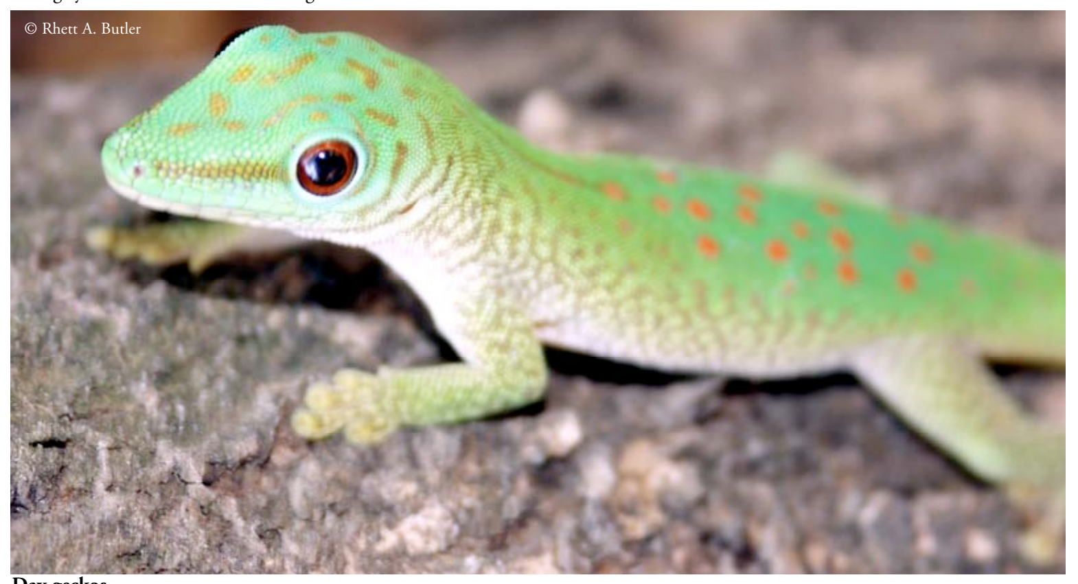
Day geckos Unlike most geckos which are nocturnal, day geckos are day-active lizards. Day geckos feed mostly on insects.

There are more than 210 species of lizards in Madagascar. Some of the better known are chameleons, geckos, skinks, and iguanids. Strangely absent from the island are agamas and monitors which are found across Asia and Africa