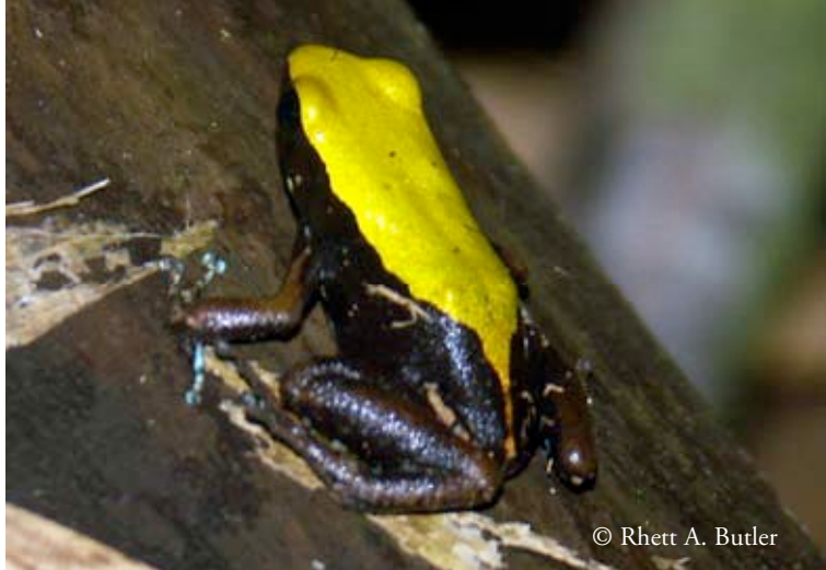
Boophis tree frogs (top and left) Boophis tree frogs are common in the rainforests of eastern Madagascar