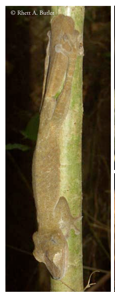
Leaf-tailed geckos Uroplatus fimbriatus (above)