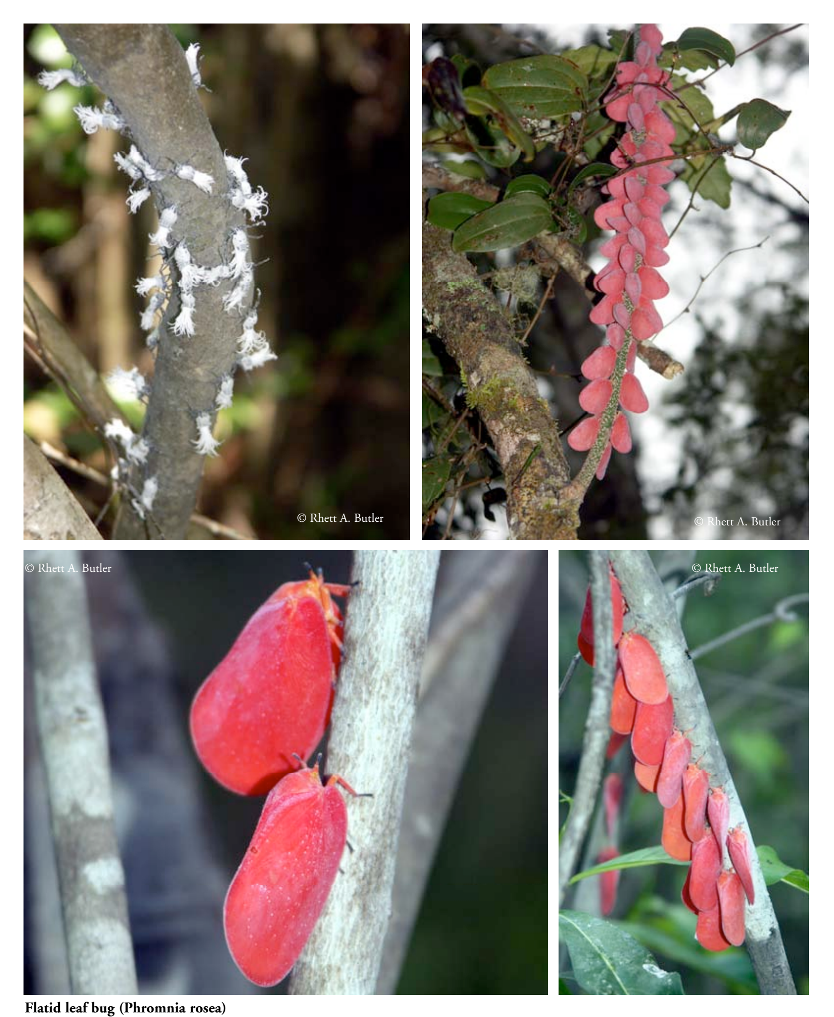
These insects undergo a remarkble transformation between their nymph (juvenile) form [upper left] and their adult form [pink coloration].